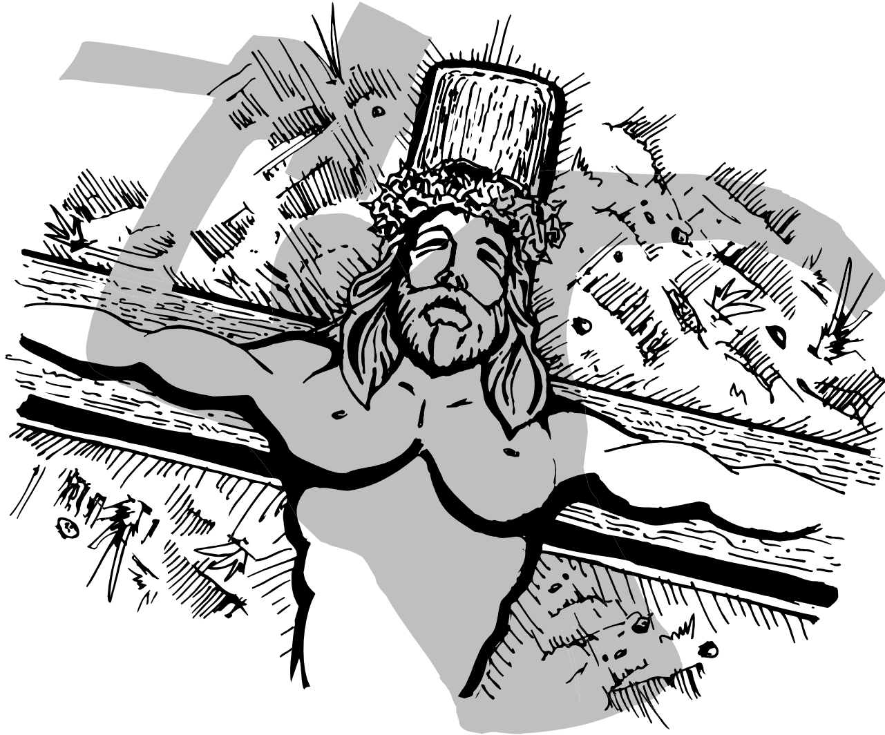
#11 - Jesus is nailed to the cross.

For additional coloring and word activities related to the Catholic faith, visit www.CatholicMom.com Feel free to share this activity with your family or students, but please consider a donation to support our mission of celebrating our Catholic Faith.